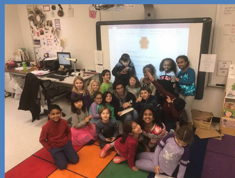
Images from Ashburton Elementary School

At the end of my day at the elementary school, I would get a ride with one of the teacher's listed above back to Grosvenor-Strathmore Station. I would then take the Metro back to College Park and start my classes for the day at the university.