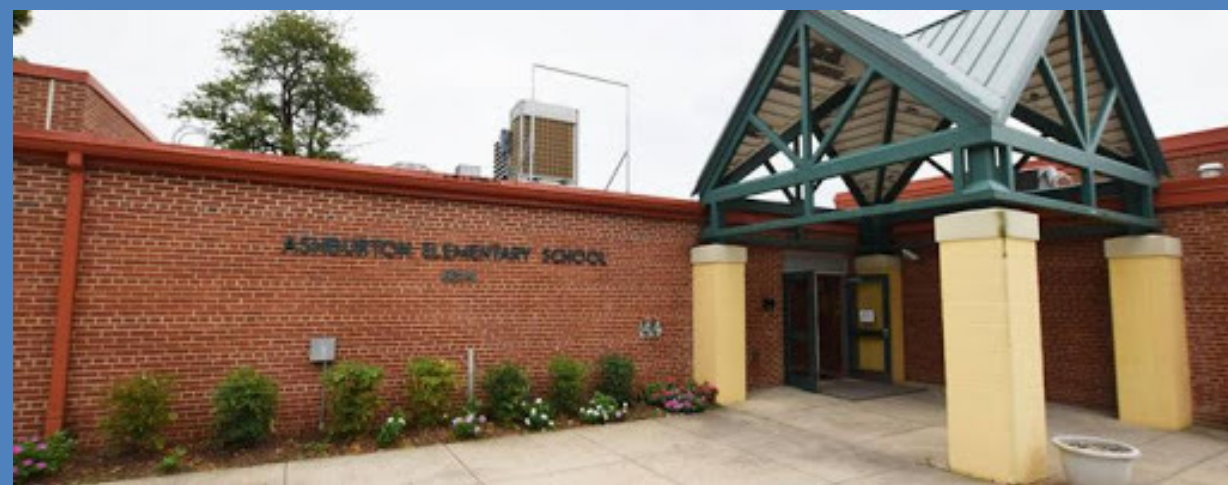
Ashburton Elementary School

Help the students understand new concepts and the importance of being in school. Assist the teacher in lightening up their workload while I am in their classroom.