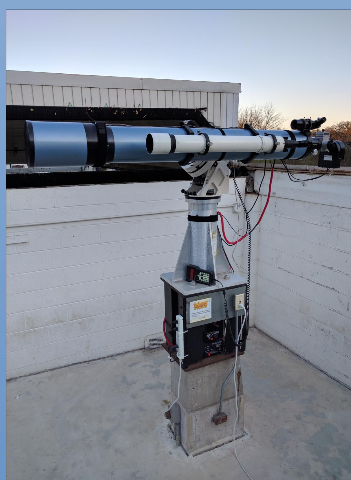
7" Astro-Physics Refractor

I worked at the University of Maryland Observatory with a partner. We used the telescope on site to observe the transit of a star. Then we used the program AstrolmageJ to process the pictures we obtained and produce a light curve. Our goal was to observe multiple transits however, quarantine cut our research short.