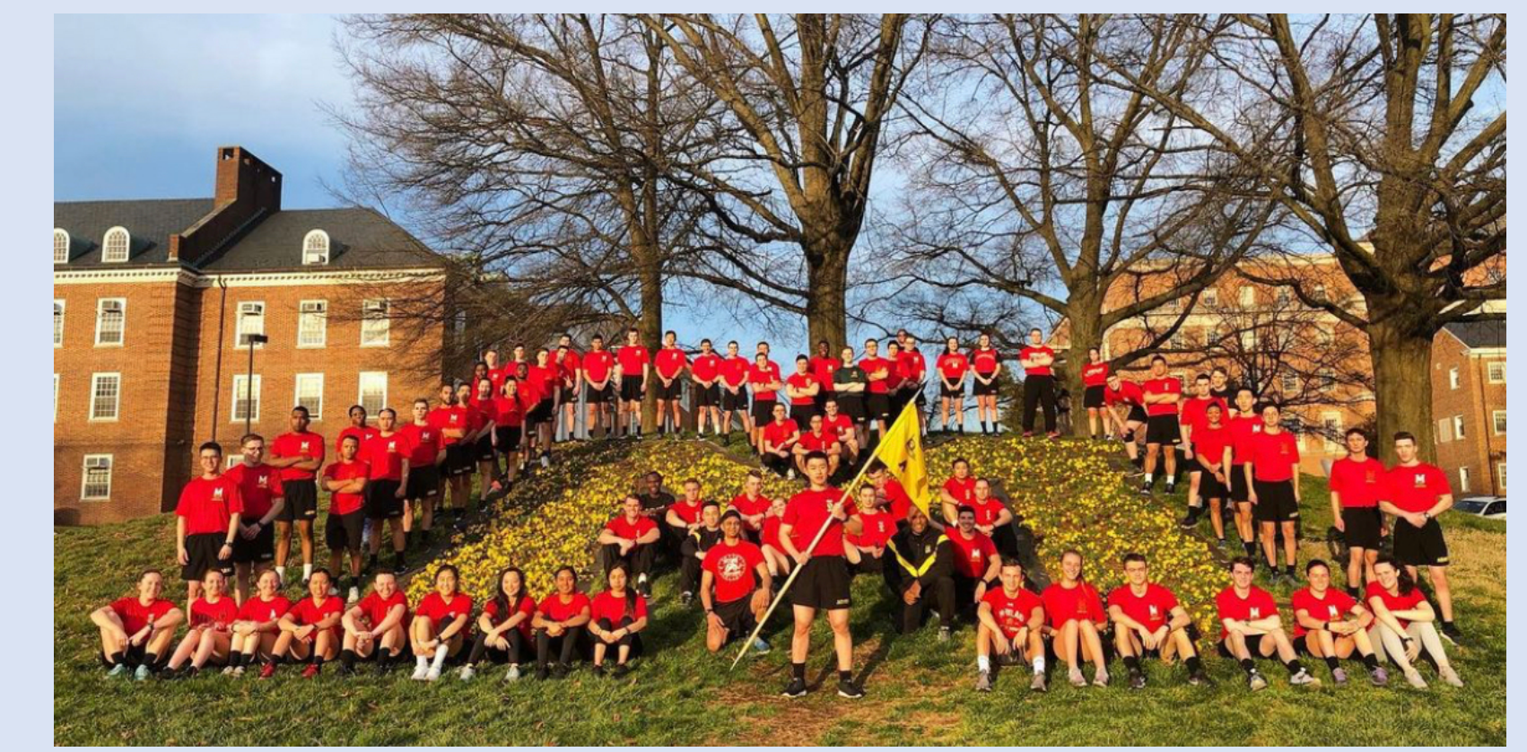
UMD Army ROTC Spring 2020 (pre-COVID)

Overall, words cannot describe how grateful I am for the mentorship and guidance from everyone listed above! Thank you!