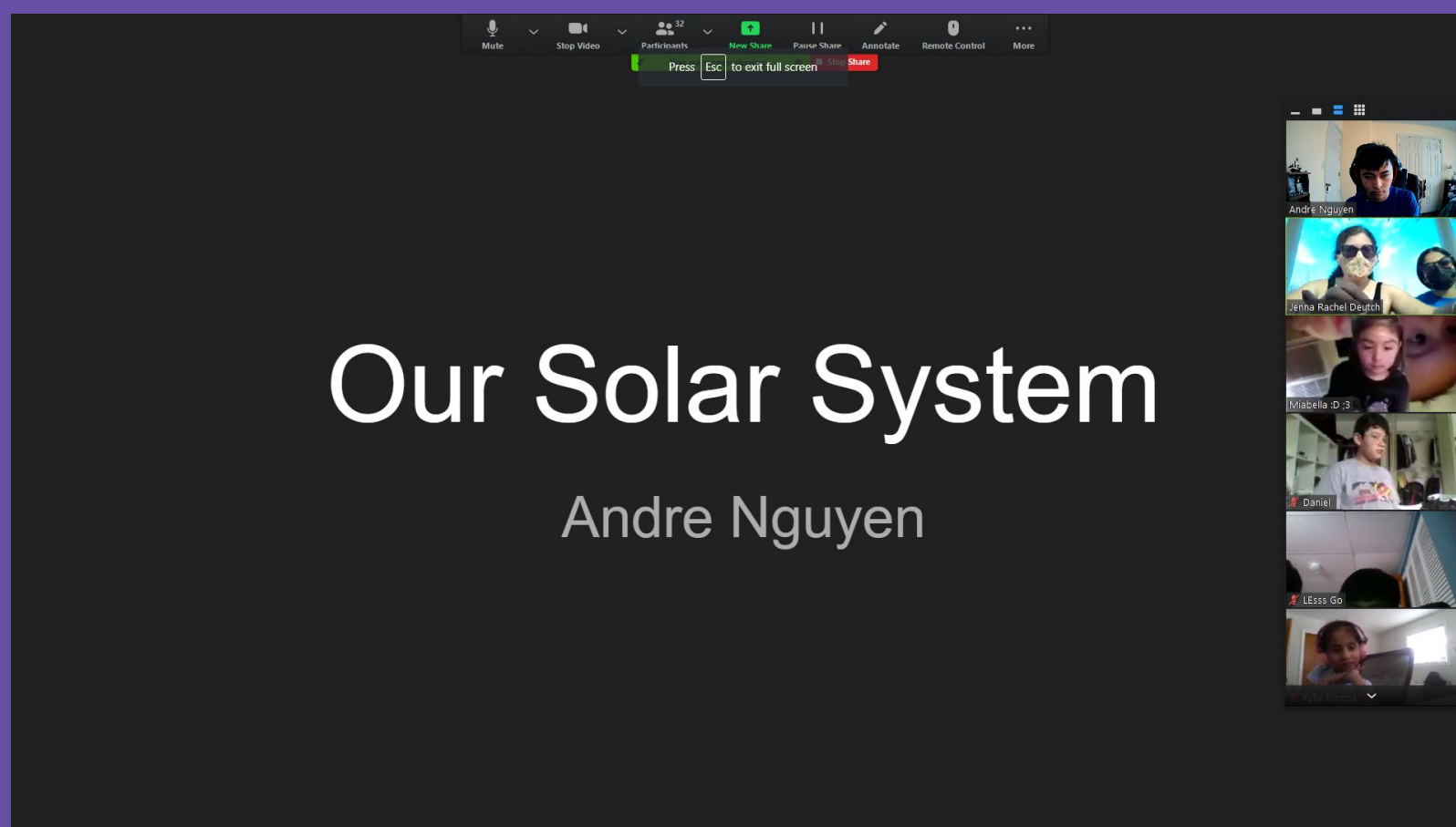
This is me preparing to give my presentation to the tutees.