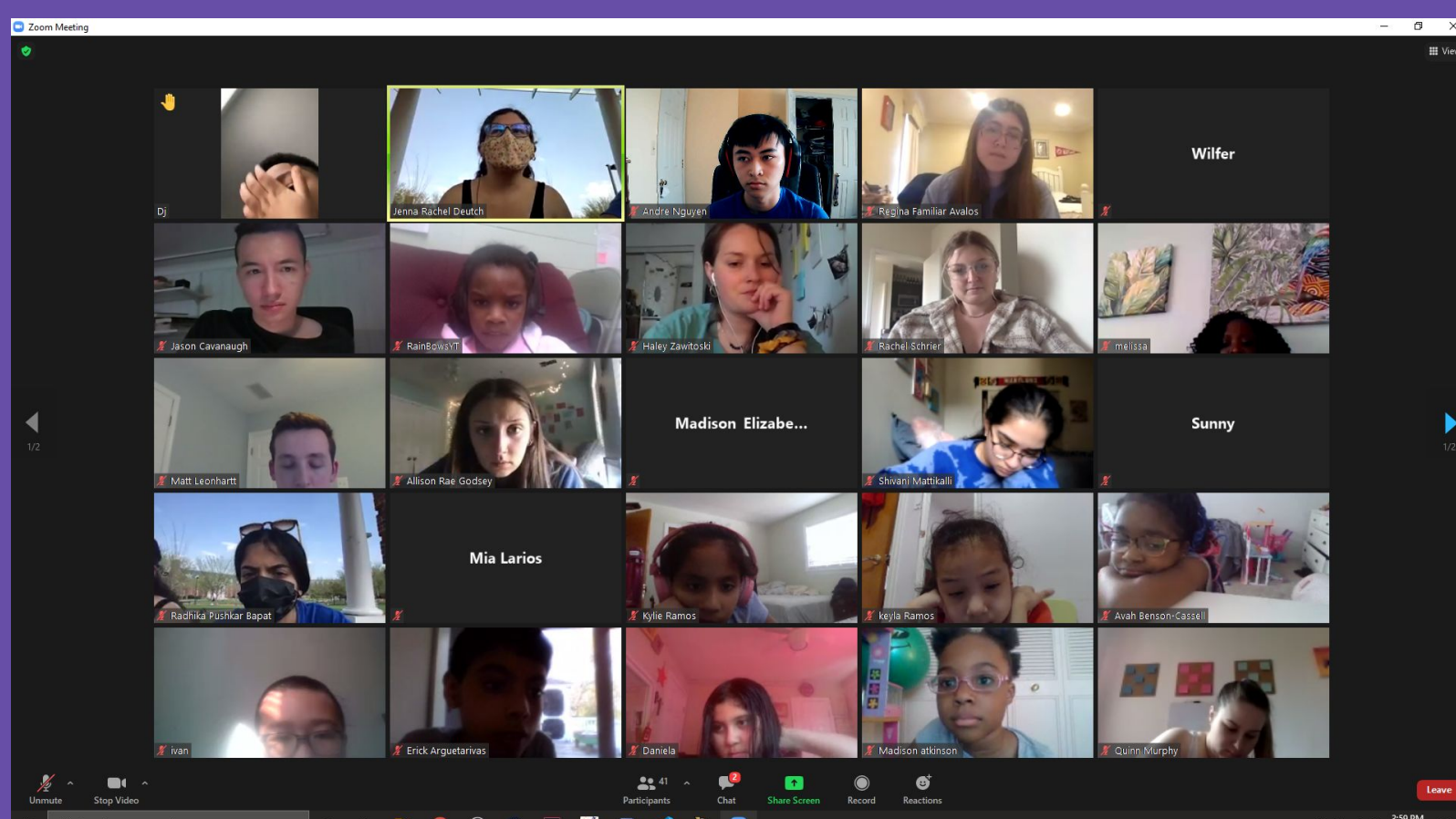
These are the tutors and tutees getting ready to go into their breakout rooms.