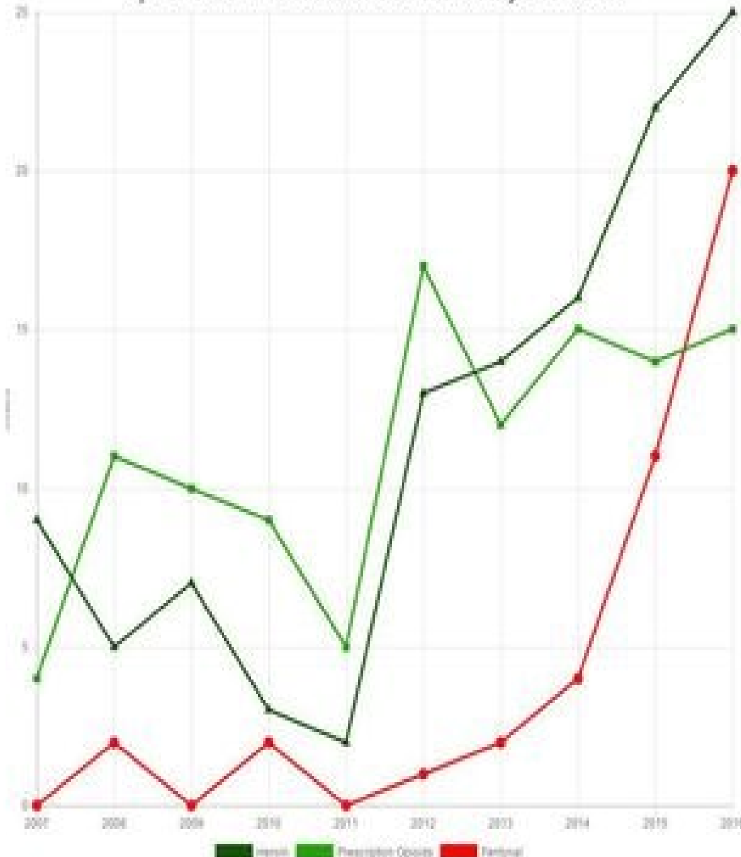
Opioid Related Deaths in Carroll County 2007-2016

https://www.livestories.com/statistics/maryland/carroll-county-opioids-deaths-mortality