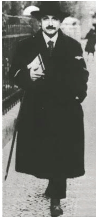
Herr Einstein in Berlin

Dr. Einstein's general theory of relativity, however, conceives of gravitation as indistinguishable from inertia. The "force" of gravity one feels pressing one down into a chair is the same as the "force" one feels when pulled forward in an automobile when the driver brakes.